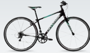
ALSO CHECK OUT QUICK SL WOMEN'S BIKES