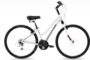
ALSO CHECK OUT ADVENTURE WOMEN'S BIKES

Whether you're taking a spin from your summer house in the Hamptons, going vineyard to vineyard in Napa or simply enjoying a sunny ride through the park with the kids, the Adventure's blend of upright comfort, lightweight efficiency and premium elegance make it the perfect choice.