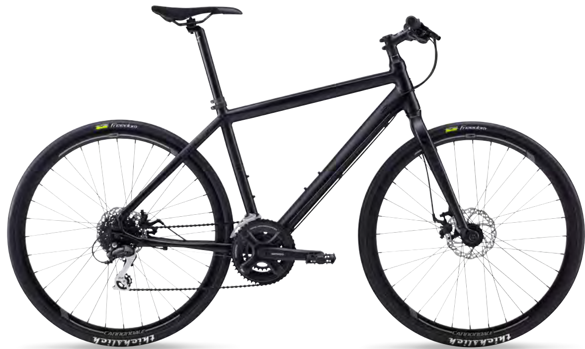
FRAME: Bad Boy, Optimized 6061 Alloy FORK: Cannondale Fatty Rigid, 1-1/8" RD/FD/SHIFT: Shimano Alivio/Altus/M310 Rapidfire BRAKES: Cannondale mechanical disc COOL BITS: Luxe Leather grips COLOR: Jet Black, w/ Reflective Decals - Matte (01)