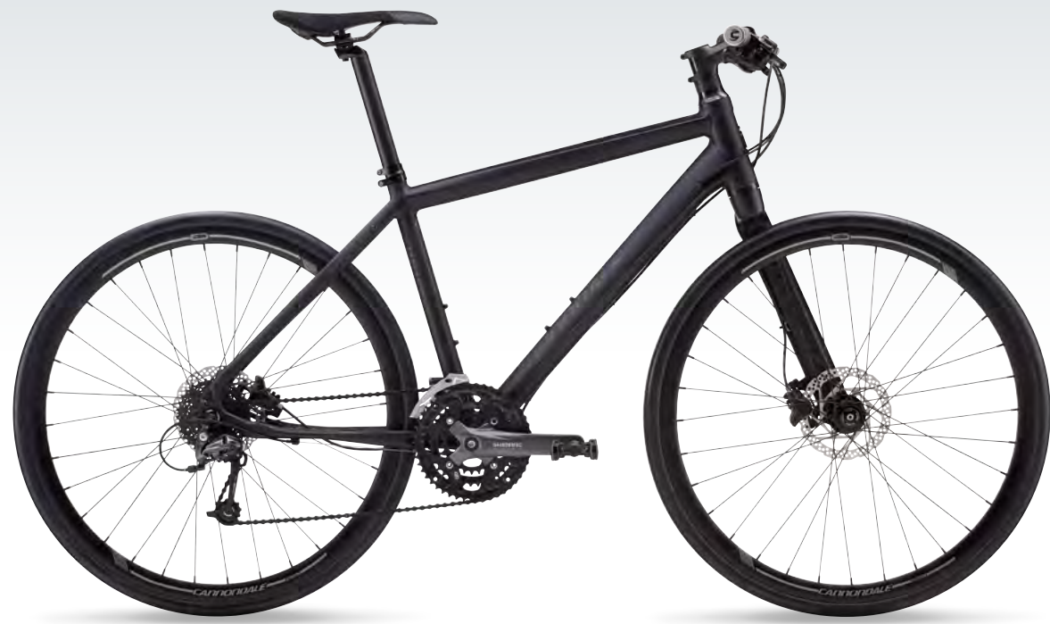
FRAME: Bad Boy, Optimized 6061 Alloy FORK: Cannondale Solo Rigid, 1.5" RD/FD/SHIFT: Shimano Deore/Acera/Altus BRAKES: Magura MT4 hydraulic COOL BITS: One Piece OPI Bar-Stem w/ Light, Luxe Leather grips COLOR: Jet Black, w/ Reflective Decals - Matte (01)