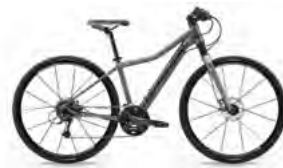
ALSO CHECK OUT WOMEN'S ALTHEA BIKES