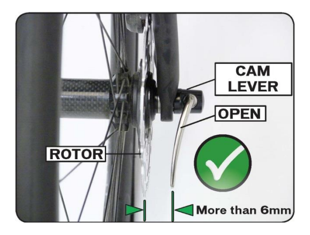
Figure 1. Quick-release lever with potential for contact